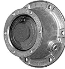
Stemco Hub Cap