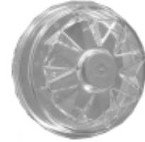
Fruehauf Pro-Par Hub Cap